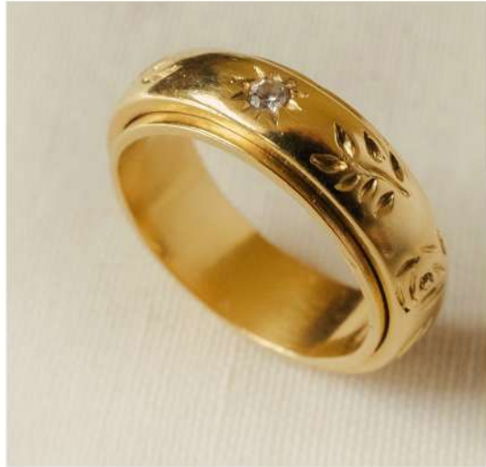
Ananta assorted flowers, blooming